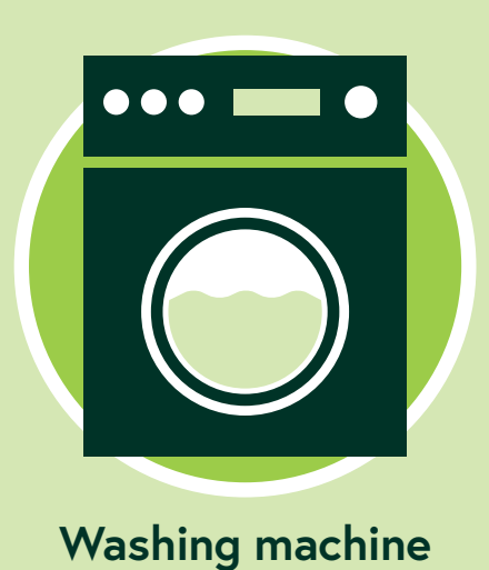
How are they programmed?